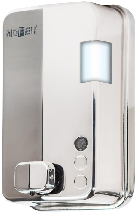
The finish of the image does not correspond to the code.